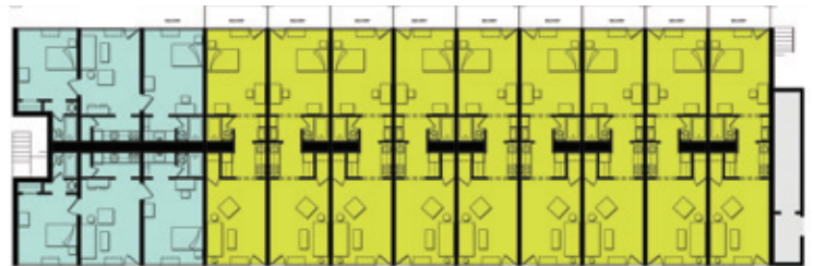
Building C - Lower & Main Levels

All floorplans and renderings are artists' conception. Dimensions, features and specifications are subject to change at the discretion of the builder.